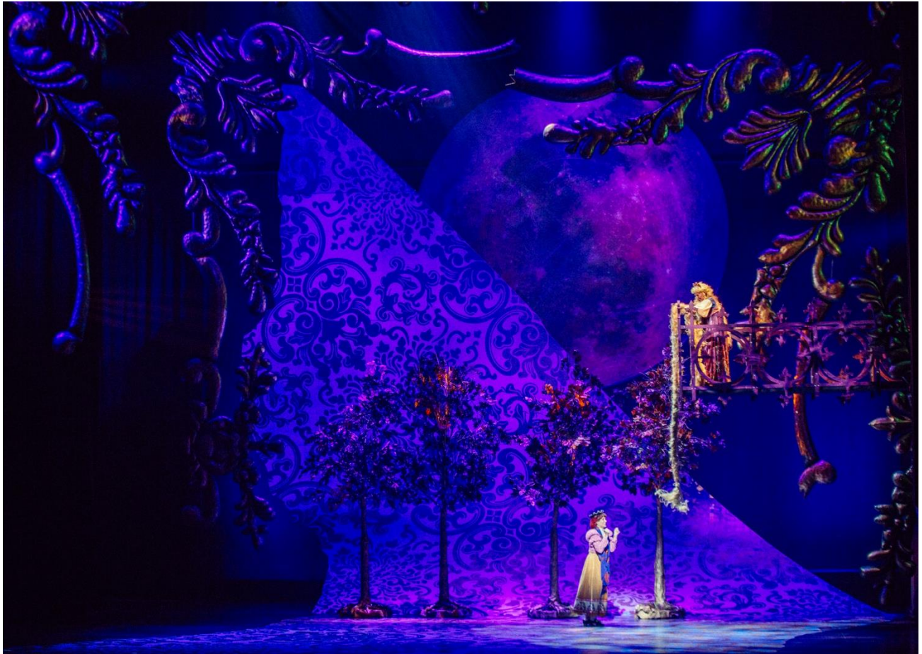
Production Photos from Theatre Under the Stars